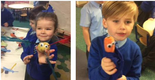
After reading Supertato we made our own vegetable superheroes