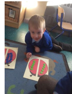
Investigating ways of making 10

This term our focus is developing children’s knowledge of working with numbers and using early addition and subtraction skills, such as putting two sets of objects together and counting the total and counting on and back.